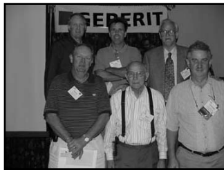
Special recognition was given to companies who have been continuous supporters for more than twenty years!